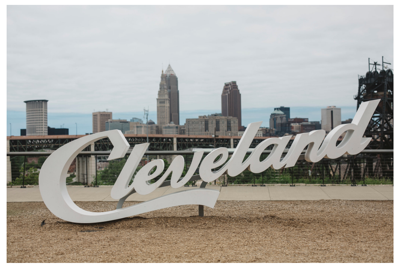
Cleveland has a made a comeback the past two decades, but many of the city's residents still live in poverty.